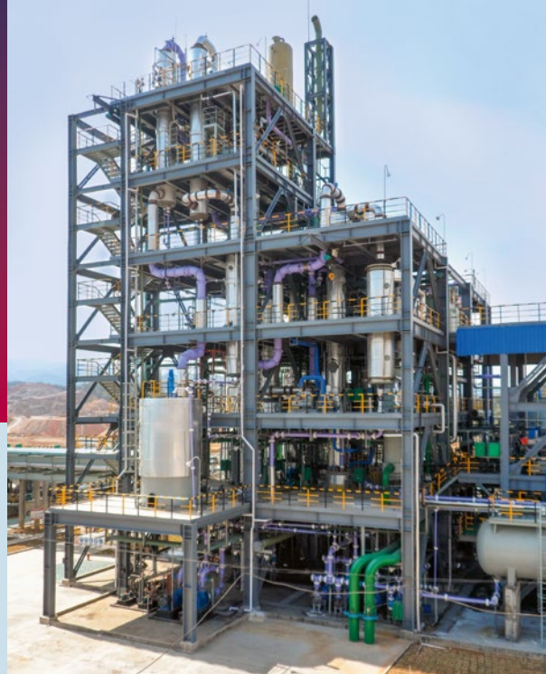
AHF Plant: Capacity 10,000 mtpy, China