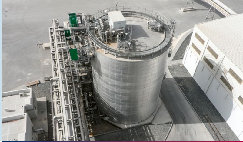
AHF Safety Storage, UAE

Learn more about our technologies. Scan the QR code now!