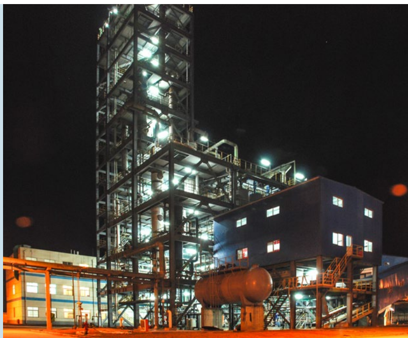
AHF Plant: Capacity 20,000 mtpy, China

The vent gas flows to the Central Absorption.