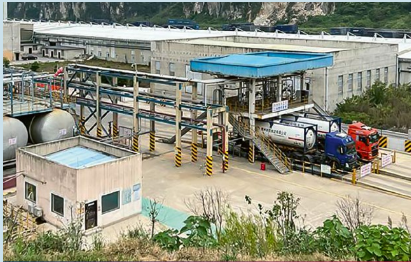
AHF loading station